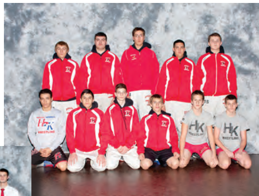
The Holley-Kendall Wrestling Team won the Genesee Region League championship and was undefeated in dual meets this season.